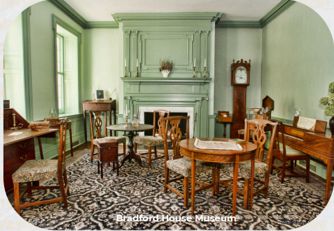
Bradford House Museum

The Greater Pittsburgh region is a perfect place to stop for lunch or spend the night en route to countless destinations, like Niagara Falls, Lancaster, Cleveland, Washington D.C and more. This taste of the region will make your travelers eager to return for more!