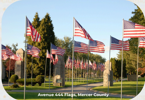
Avenue 444 Flags, Mercer County