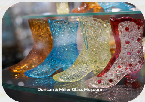
Duncan & Miller Glass Museum