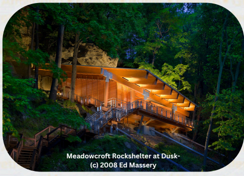
Meadowcroft Rockshelter at Dusk