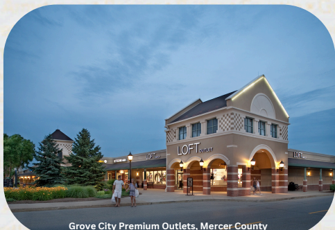
Grove City Premium Outlets, Mercer County