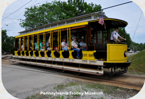
Pennsylvania Trolley Museum