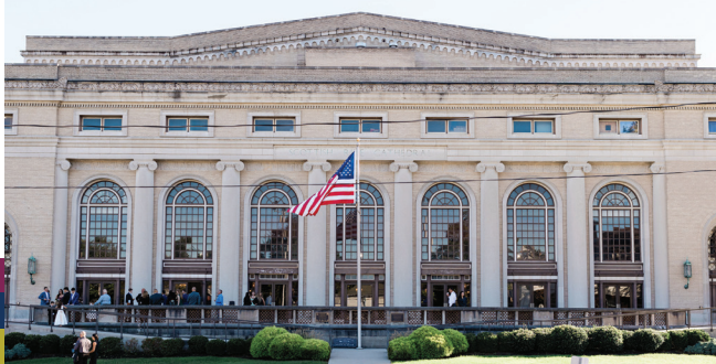
The Scottish Rite Cathedral