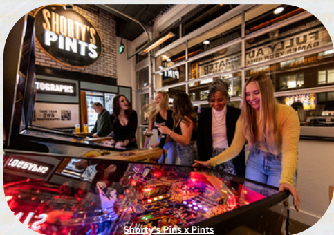
Shorty's Pints x Pints