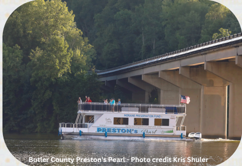
Butler County Preston's Pearl