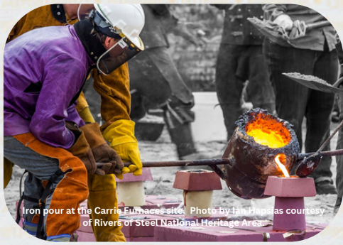
Iron pour at the Carrie Blast Furnace site.