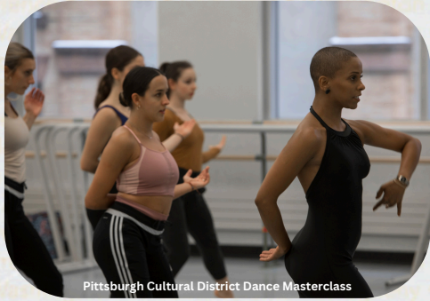
Pittsburgh Cultural District Dance Masterclass