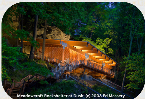
Meadowcroft Rockshelter at Dusk