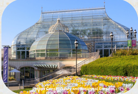
Phipps Conservatory and Botanical Gardens